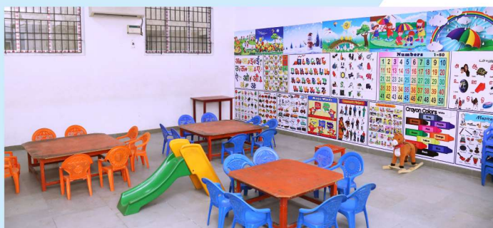
The joy at SBV was doubled this year when the K.G campus was shifted to the main campus.